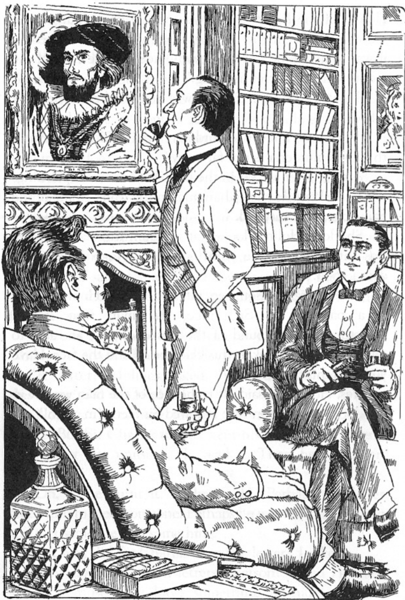
Sherlock Holmes was interested in the painting of Sir Hugo Baskerville, dated 1645.