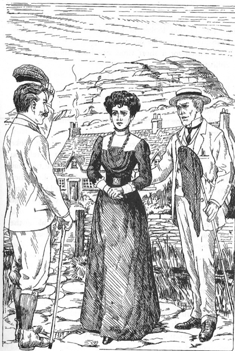
I thought Miss Stapleton looked very different from her brother.

'How do you do, Miss Stapleton,' I said. 'Your brother has told me about the Great Grimpen Mire and the unusual flowers and birds. Did you hear that strange sound a moment ago? Does the wind often make this sound?'