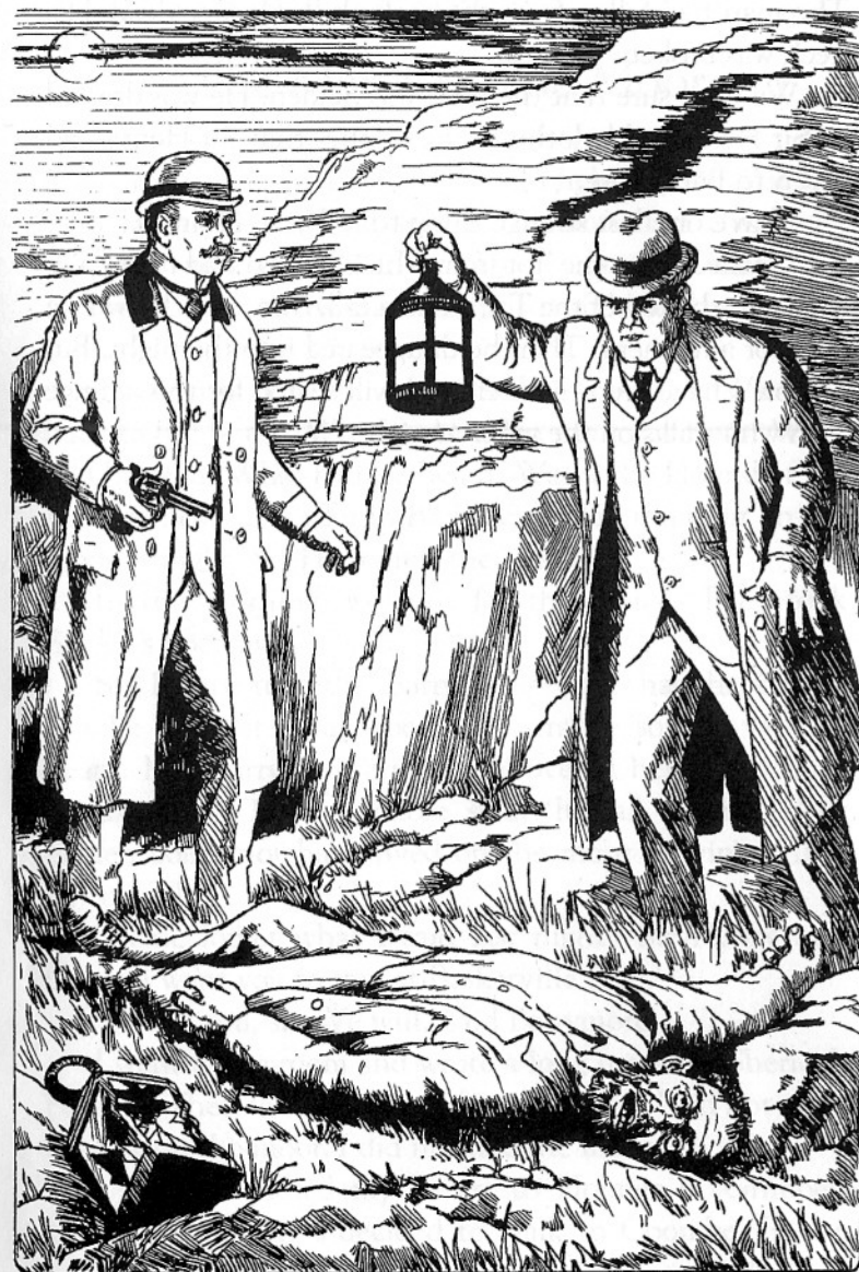
We found the body of a man at the foot of the Tor.