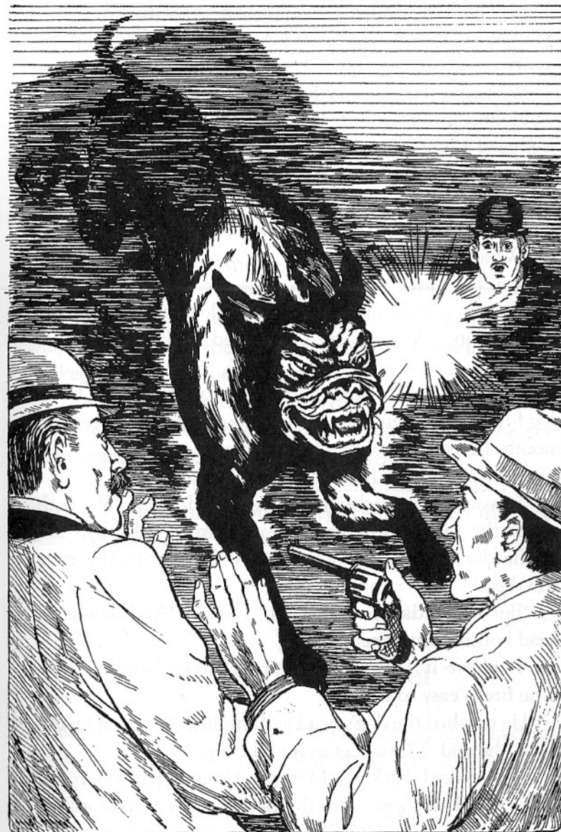
In the light of the flash, we saw a huge black shape.