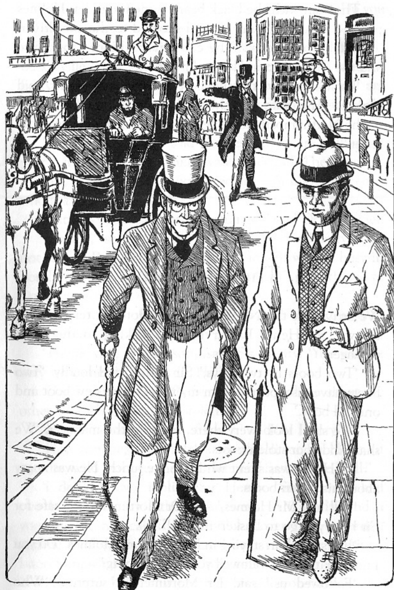
A man with a black beard was sitting in the cab. He was watching Sir Henry and Dr Mortimer.

I looked where Holmes was pointing. A horse-drawn cab was moving slowly along the street. A man with a black beard was sitting in the cab. He was watching Sir Henry and Dr Mortimer as they walked towards Oxford Street.